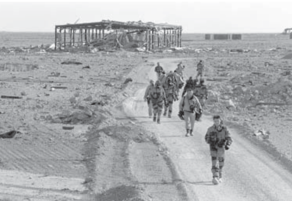
H. Arvidson/United Nations

Since inspectors have not been in Iraq since 1998, it was impossible for the White House to proffer solid evidence that Iraq possessed weapons of mass destruction that could target US interests. Instead, the Bush administration, buttressed by the media interviews of former inspectors, posited that UNSCOM’s inability to confirm