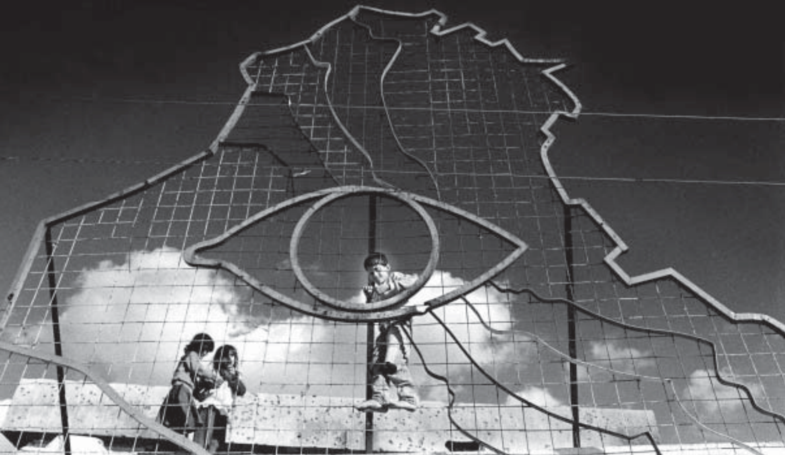
Kurdish children climb on sculpture atop former Iraqi intelligence headquarters in Suleimaniya in northern Iraq.