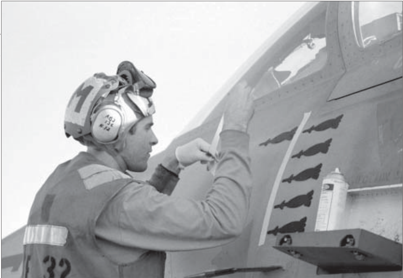
US serviceman paints a bomb to symbolize the warplane's each bombing run during Operation Desert Fox, December 1998.